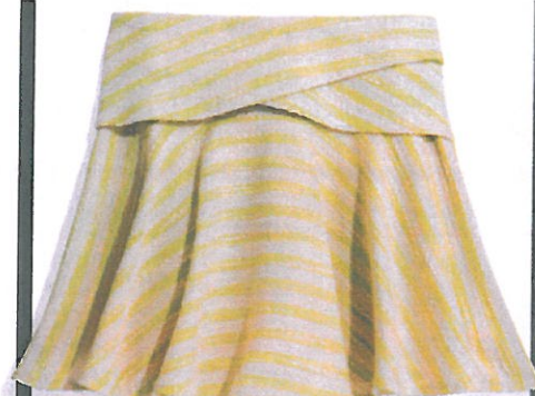
FLARE SKIRT BCBGeneration, $68, bcbgeneration.com