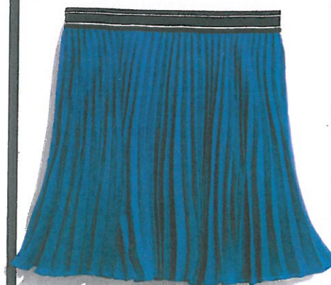
BLUE SKIRT Bongo, $34, sears.com