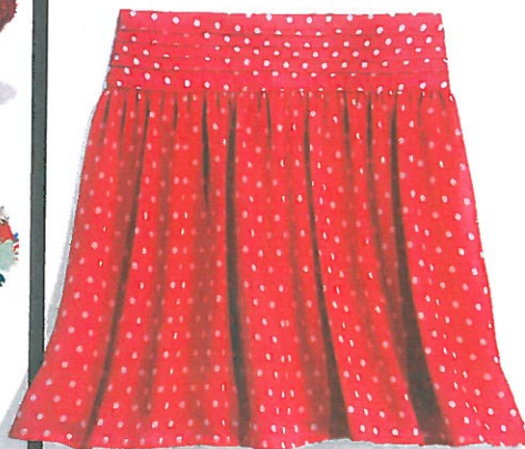
POLKA-DOT SKIRT Olsenboye, $42, jcpenny.com

Pleats show off your girly side—and your great legs.